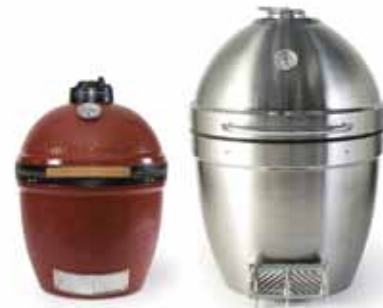
Size Comparison of ClassicJoe and ProjEO