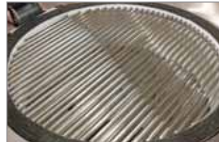
Upper Cooking Grate with Both Sections Inserted