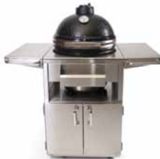
ClassicJoe Black Stand Alone with Stainless Steel Bands & Hinge in Stainless Steel Cart