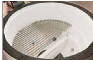
Two-Piece Design 3/8" 304 Stainless Steel Upper and Lower Cooking Grates