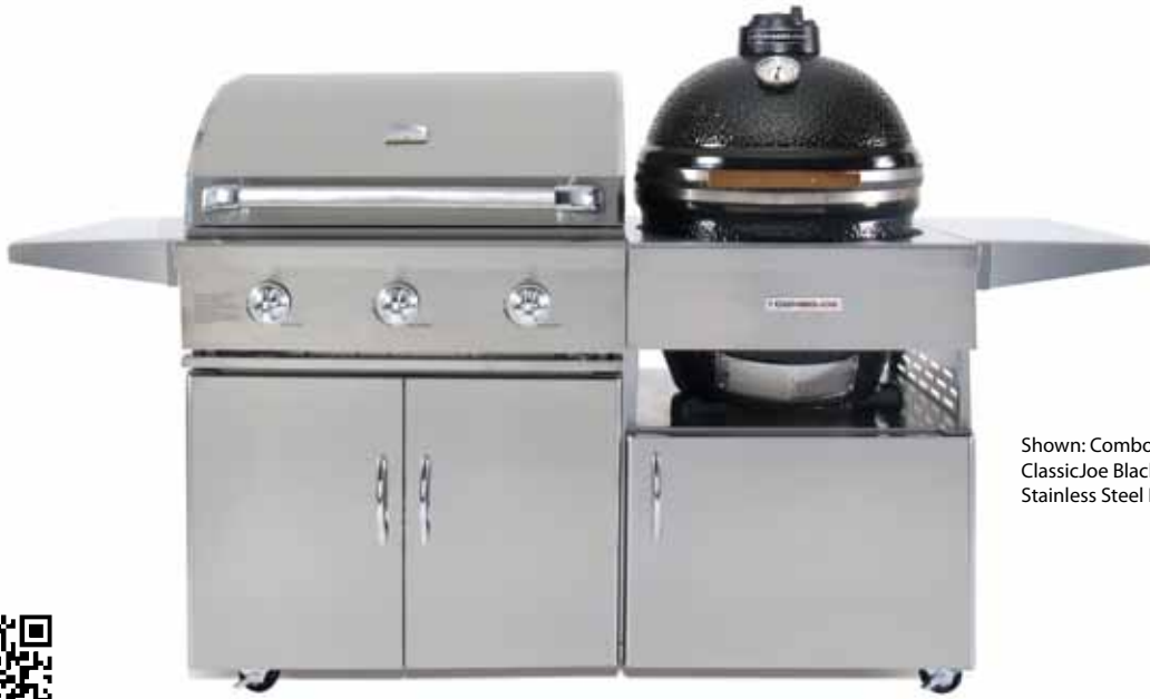
Shown: ComboJoe 32" with ClassicJoe Black Stand Alone with Stainless Steel Bands & Hinge