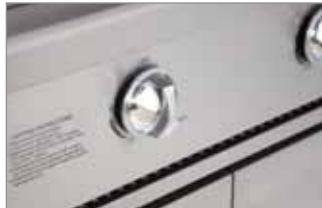
Polished Accent Knobs and Handles