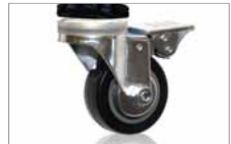
Oversized Locking Caster Wheels for Stability and Easy Movement