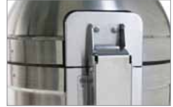
Perfectly Counterbalanced Hinge with Static Positioning as low as 10°