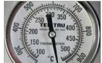
Extra Large Thermometer for Greater Readability