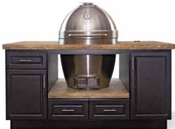
Pro Joe with Optional Grill Table