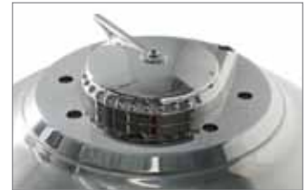
Investment Cast 304 Stainless Steel Top Vent with Mirror Finish

KamadoJoe Specifications | KamadoJoe.com/projoe.html