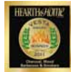
2011 Vesta Award Winner