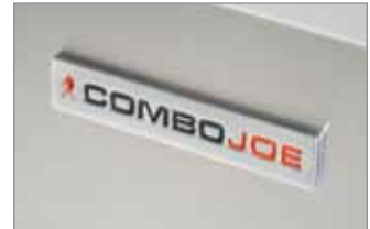
Premium Stainless Steel Finishing