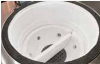
Fire Box Divider for Higher Fuel Efficiency or to Create Separate Cooking Zones

KamadoJoe Specifications | KamadoJoe.com/projoe.html