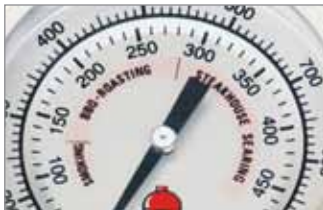
Extra Large Thermometer for Readability

BigJoe Specifications | KamadoJoe.com/classicjoe_bigjoe.html