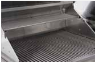
8mm Cooking Grate Rods with Warming Rack

KamadoJoe Specifications | KamadoJoe.com/combojoe.html