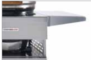
Removable Side Shelves