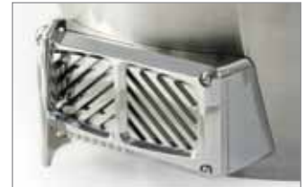
Investment Cast 304 Stainless Steel Draft Door with Mirror Finish