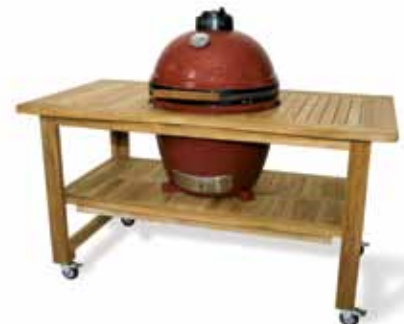
ClassicJoe Red Stand Alone with Black Bands & Hinge in Teak Grill Table