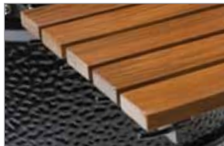
Finished Bamboo Side Shelves with Utensil Pins (4 Each Side Shelf)